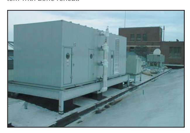
Custom Air Handling Unit & Chillers

The HVAC system utilizes chilled water from the Schlitz Park central plant for cooling. We installed 10" underground chilled water supply and return piping from the central plant to the renovated office building approximately 1500 feet away. Once inside, chilled water is distributed to each floor, where it serves separate 60 ton air-handling units. Each air-handling unit is supplied with outside and exhaust air through a central shaft running vertically up through the roof. A 100 ton rooftop unit serves the fourth floor. Each floor consists of a VAV distribution system with zone reheat.