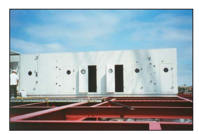
Custom Air Handling Unit

Completion of work on this facility had to be done in such a fashion as to cause minimal disruption to occupied spaces and class schedules. Grunau Company was proud to be part of this exciting project, and especially to have the opportunity to partner with the following team members: