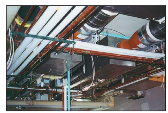
Overhead Mechanical Services for Lab Hoods & Tables