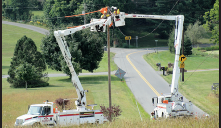
E-J Electric Installation Co. ( No. 63 ) is known for work in the New York area, but its new transmission and distribution division now is doing overhead-line storm repair in places such as Michigan, Ohio and Maryland.