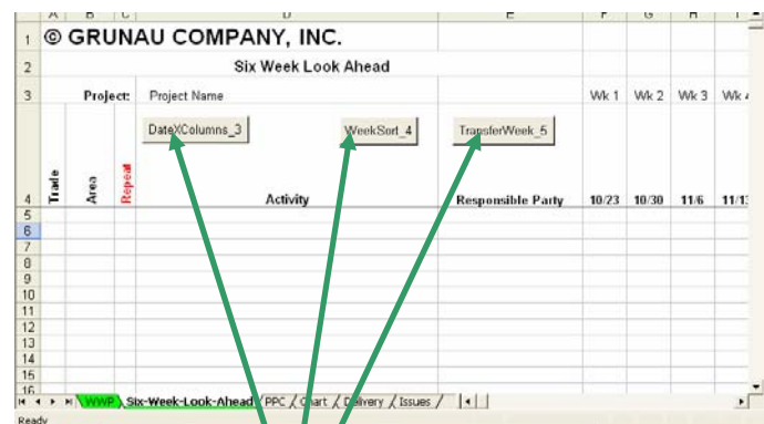
Example of Macro buttons in 1 worksheet of Last Planner